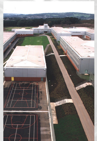
VIEW OF OUTSIDE AREA